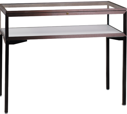
3148 10"H x 48"W x 24"D (pictured in SKU 3148HT-BZ-LB: Hinged Top, Dark Bronze frame finish, and Black Leg Base)

Keepsake Series cases are built to highlight your collections, and perfect for museums, libraries, historical societies, or any organization that needs a secure way to present valuable objects. You can appreciate the craftsmanship of the tabletop model which offers either a hinged top or sliding rear doors and comes with four black-coated steel legs.